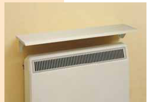
Storage heater with shelf